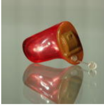
Model CIC 9000