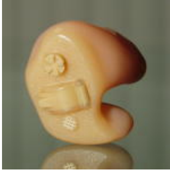
Model LP 3000 (Low Profile)