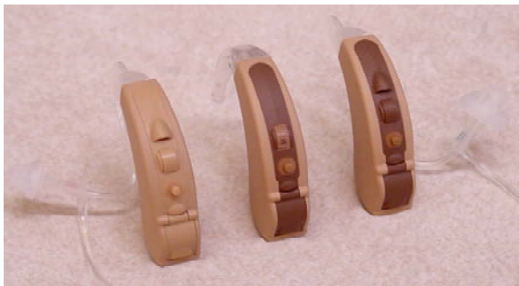
LIBERTY CONVERTIBLE OTE/BTE