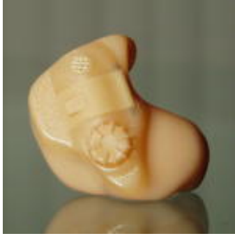
Model FS 1000 (Full Shell)