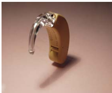
BTE (Behind the Ear)